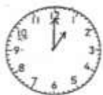
Unn eur yw.