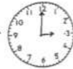
Teyr eur yw