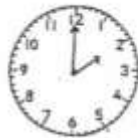
Diw eur yw.