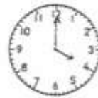
Peder eur yw.