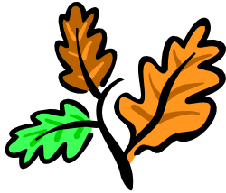
Kynyav yw It is Autumn