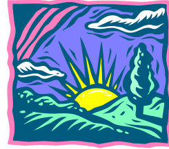
Hav yw It is Summer