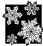
Gwav yw It is Winter

Kernow Cornwall Kembra Wales Iwerdhon Ireland Pow Sows England