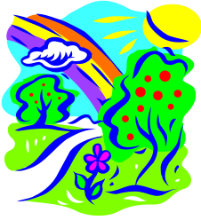
Gwenton yw It is Spring